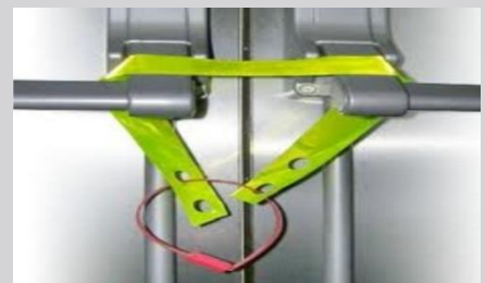
C) Sealing security systems with different means (SEALS)