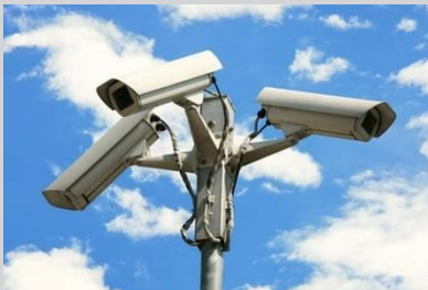
A) Electronic security such as video surveillance

All the Port Areas (TERMINALS) must be equipped with control systems against any terrorist attack. These must monitor the entry and exit of any person, product and means of transport.