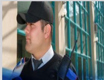
B) Supervisory staff security