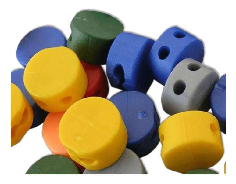
Specifications and design are subject to change without any notice or obligation from the manufacturer